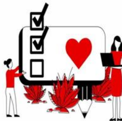
Evaluation by Host Institute