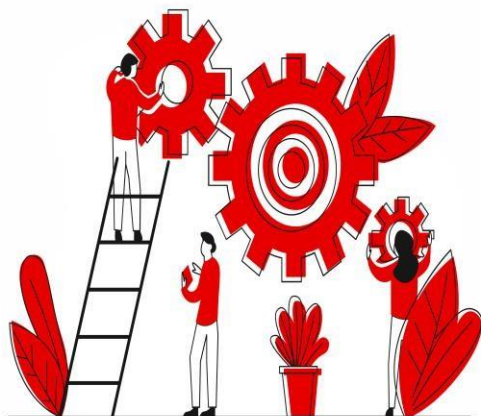
Evaluation & Shortlisting by DESC