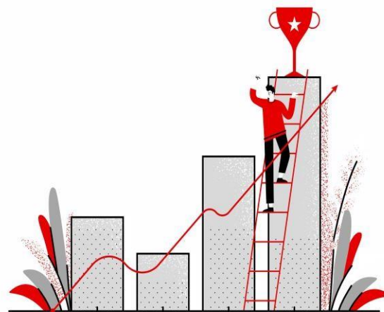
Final List of Ideas for Support