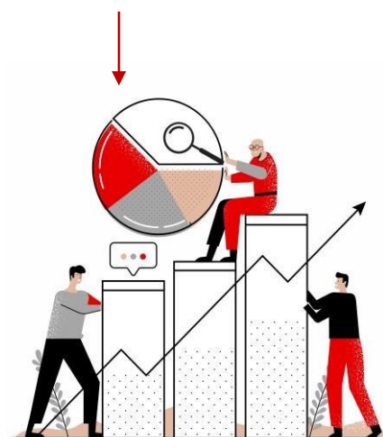
Screening by PM