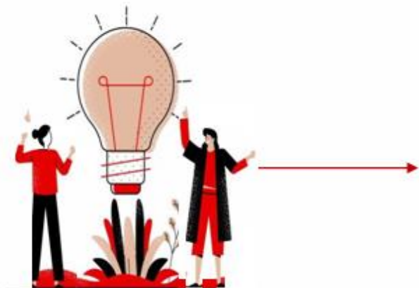
Idea Application (from 27 th June – 11 th July 2023)